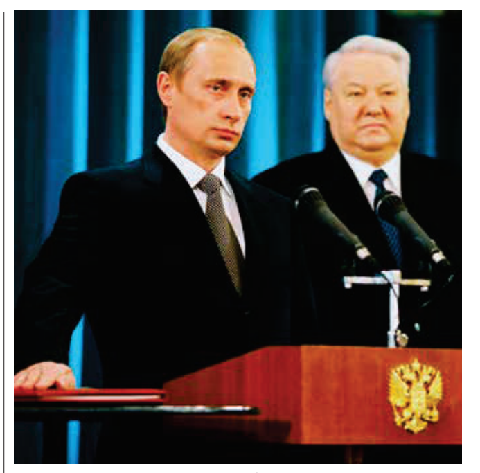
Vladimir Putin taking the Presidential Oath, May 7, 2000. Yeltsin in the background.

of a continuous and sustained irritation in the West throughout the 1990s. The West had granted the Soviet Union, later Russia, one credit after another, to shore up the country's economy and, more generally, to lend its support for establishing in Russia a stable financial and economic system. However, all "macroeconomic help" seemed to be "wasted", an adviser of the British Prime Minister put down in a memo on March 24, 1993, if the "lack of monetary discipline in Russia" were to continue.<sup>41</sup> Indeed, over the time an impatience